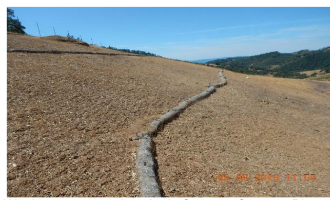
Wattle on construction site in Sonoma County

Staff has used the data available in Stormwater Multiple Application and Report Tracking System (SMARTS) to identify Qualified Storm Water Pollution Prevention Plan Developers (QSD) and Practitioners (QSP) that are developing and implementing a large number of Storm Water Prevention Plans (SWPPP) in the region. Staff is then scheduling meetings with those firms or individuals to review the requirements and start relationship building. Additionally, staff is conducting joint inspections with cities and county inspection staff to build collaborative relationships and build inspection consistency. So far over 80 construction sites have been inspected, exceeding our performance targets for fiscal year 2019/2020.