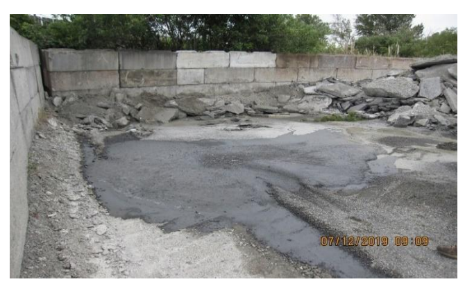
Concrete facility (Humboldt County).

Industrial inspections have been focused on response to complaints, sites with past compliance issues, sites filing for termination of coverage, and key sectors such as concrete, quarries, and auto wrecking facilities.