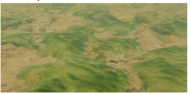
Benthic Cyanobacteria – Russian River Cloverdale