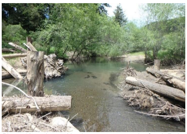
Phase 1A engineered log jam structures on the South Fork Ten Mile River.

administration, site management, construction and site revegetation. The inclusion of an SEP as part of an enforcement action is a key method of ensuring that monetary penalties are directed back toward the watersheds and communities directly impacted by water quality violations and their associated degradation of water quality conditions. This SEP is an outstanding example of how to utilize enforcement actions to have significant improvements in water quality, water resources, and aquatic habitat recovery.