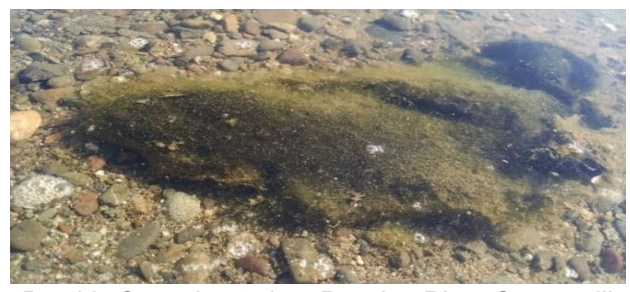
Benthic Cyanobacteria - Russian River Guerneville

The presence of multiple cyanotoxins have been documented in benthic mats at concentrations that suggest a revision of the State's public health alert posting guidance is warranted and should be based upon the presence of specific benthic cyanobacteria species and toxin concentrations within mats which are the most probable vector for dog deaths and likely a public health risk, especially for children.