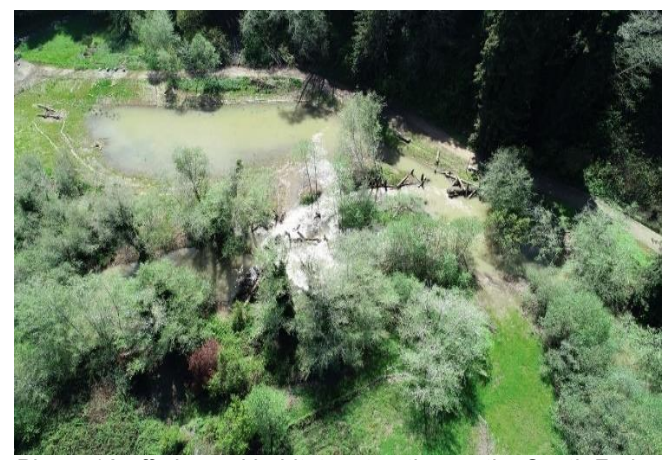
Phase 1A off-channel habitat restoration on the South Fork Ten Mile River.